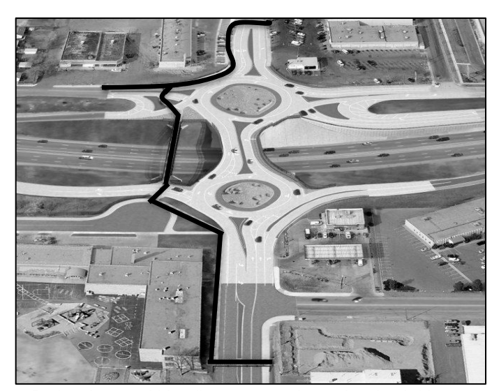
Pedestrians and bicyclists can use the pedestrian bridge once it is open to the public later this summer.